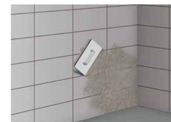
5 Apply the joint mortar