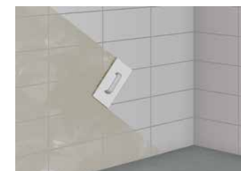
9 Rinsing off surfaces diagonally to the joint direction