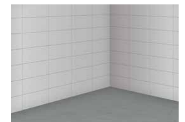
10 Finished and jointed wall surface