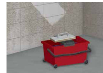
7 Moisten and press out the clean sponge board