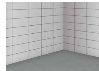
1 Available floor surface, bonding bed is set