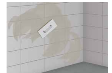
8 Emulsify the joint mortar after setting