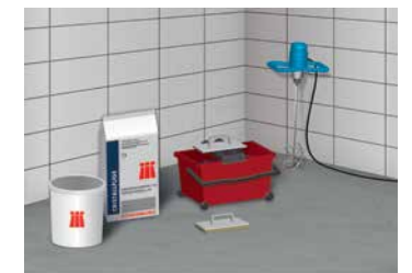
2 CRISTALLFUGE, suitable tools