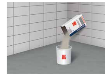
3 Fill the joint mortar into a clean mixing bucket