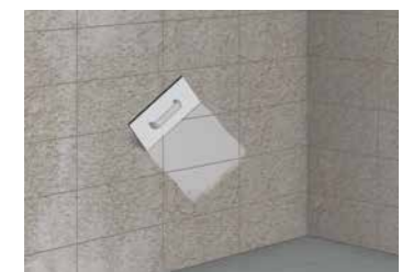
6 Sliding diagonally across excess joint mortar