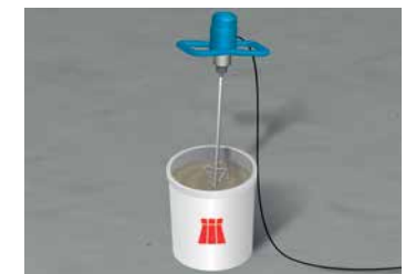
4 Mix the joint mortar